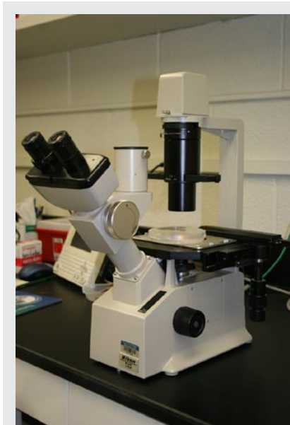
Figure 1. An inverted microscope has a light source above the stage while the objectives are mounted on a nosepiece below the stage.

and if needed specific areas of the cultures can be marked for more detailed examination later on a